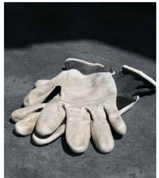
Each and every slab is hand-cast and hand-finished.