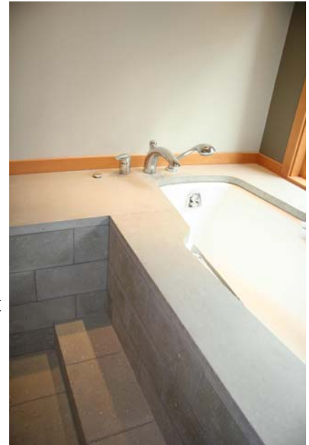
Bathtub surround and tiles in "Natural"

Recycled content values are calculated based on the ISO 14021 method, which means the weight of all the water used in the process, even if it is not retained in the final product, is added into the total mass of the product.