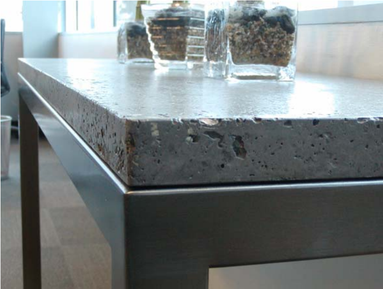
The ubiquitous paper, holes and rough edges are what makes Squak unique.